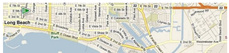
Map #2.....Hamburger Mary's at Broadway and Alamos